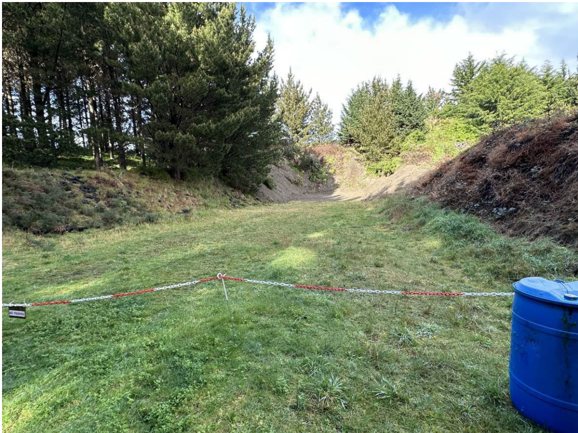
Range 1, 45m Range