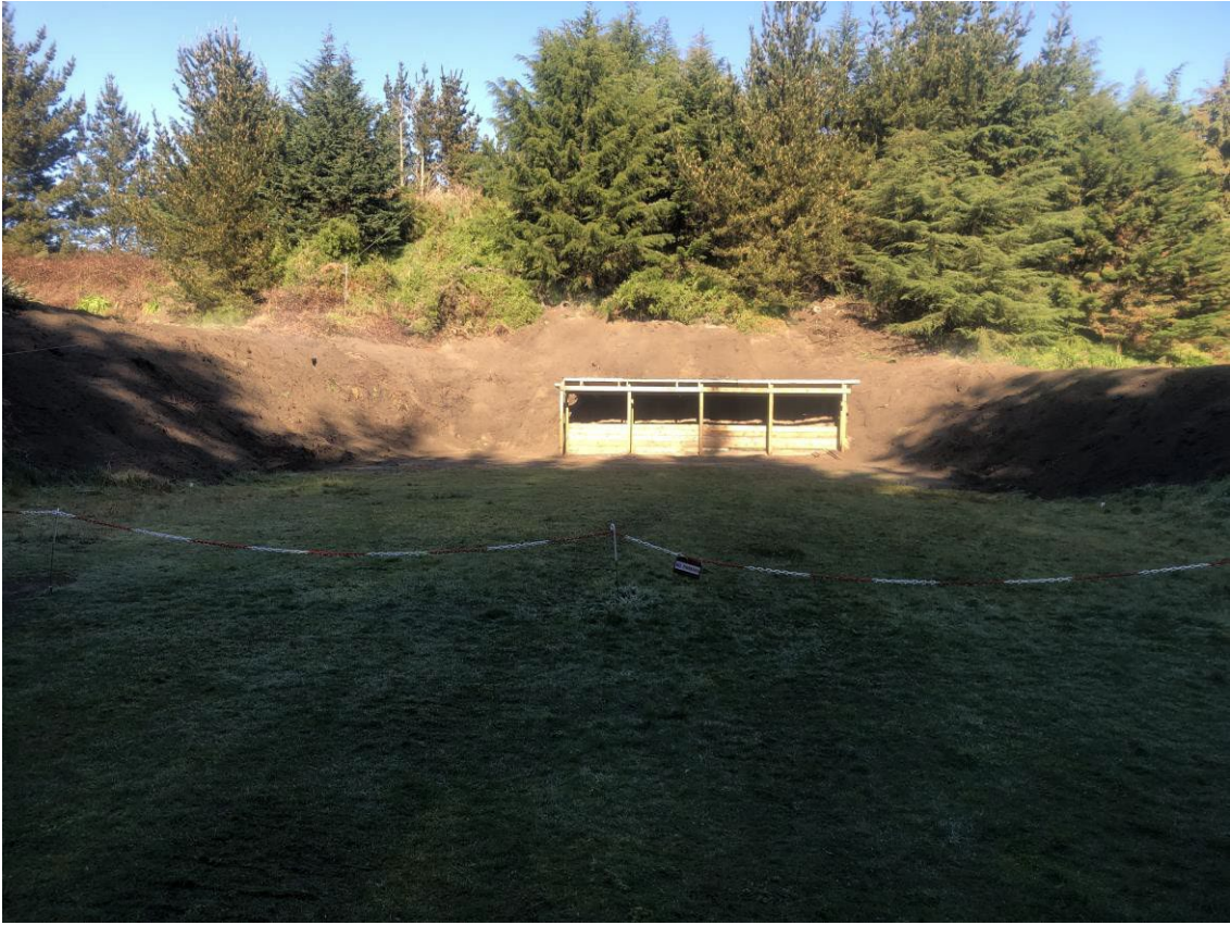
Range 2, 25m Range