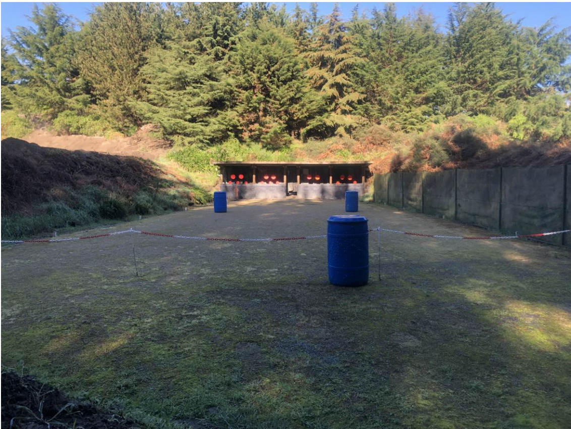
Range 3, 25m Range