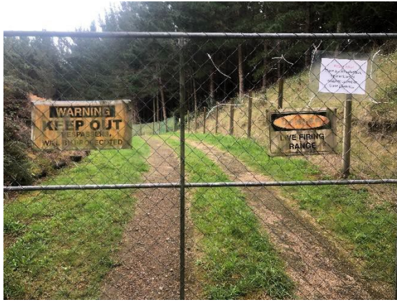
Range entrance way